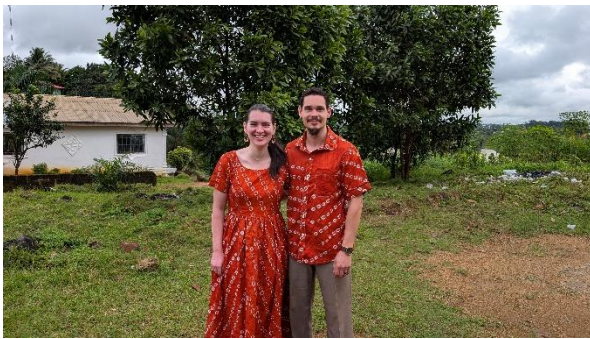
Our set of matching African lappa clothes

Thanks again for your prayers for our move to Liberia! Praise the Lord, we have been settling in and adjusting well, and God has answered so many prayers and blessed in so many ways!