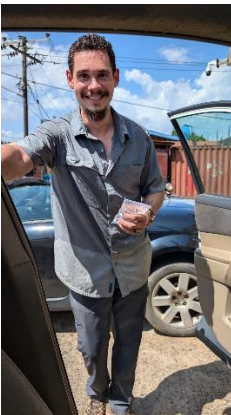
Drinking from a bag of water on a hot, muggy workday