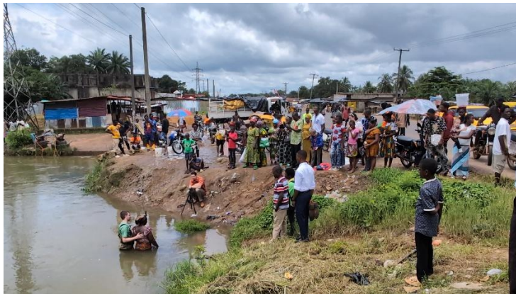
A TBC baptism in the river in Carwash Community