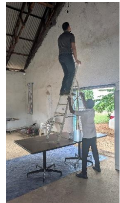
Changing a light bulb at church - desperate times, desperate measures!